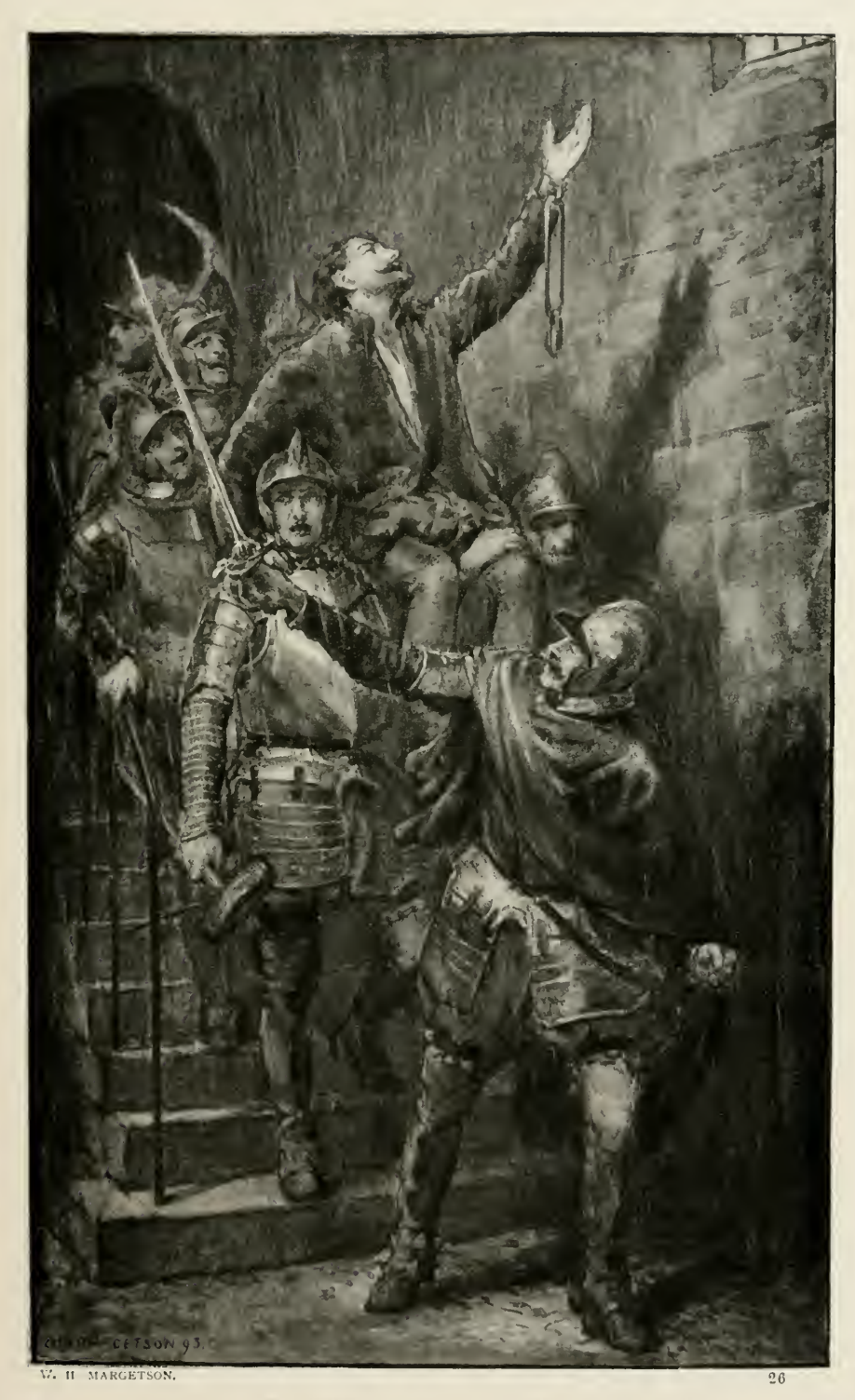
THE RESCUE OF KINMONT WILLIE FROM CARLISLE CASTLE.

AN INCIDENT OF BORDER WARFARE. (A.D. 1596.)